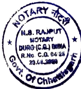
PHOTO COPY ATTESTED