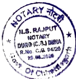
PHOTO COPY ATTESTED